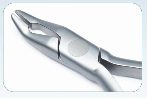
Weingart Plier - Standard